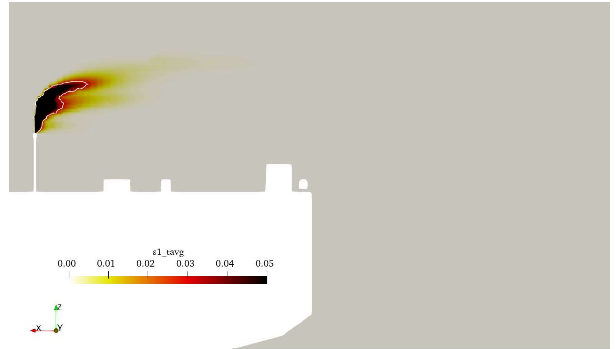
Fig. 5 Time-averaged NG-concentration (line: 3%) from 100s to 200s, for the cross-section of the vent post.