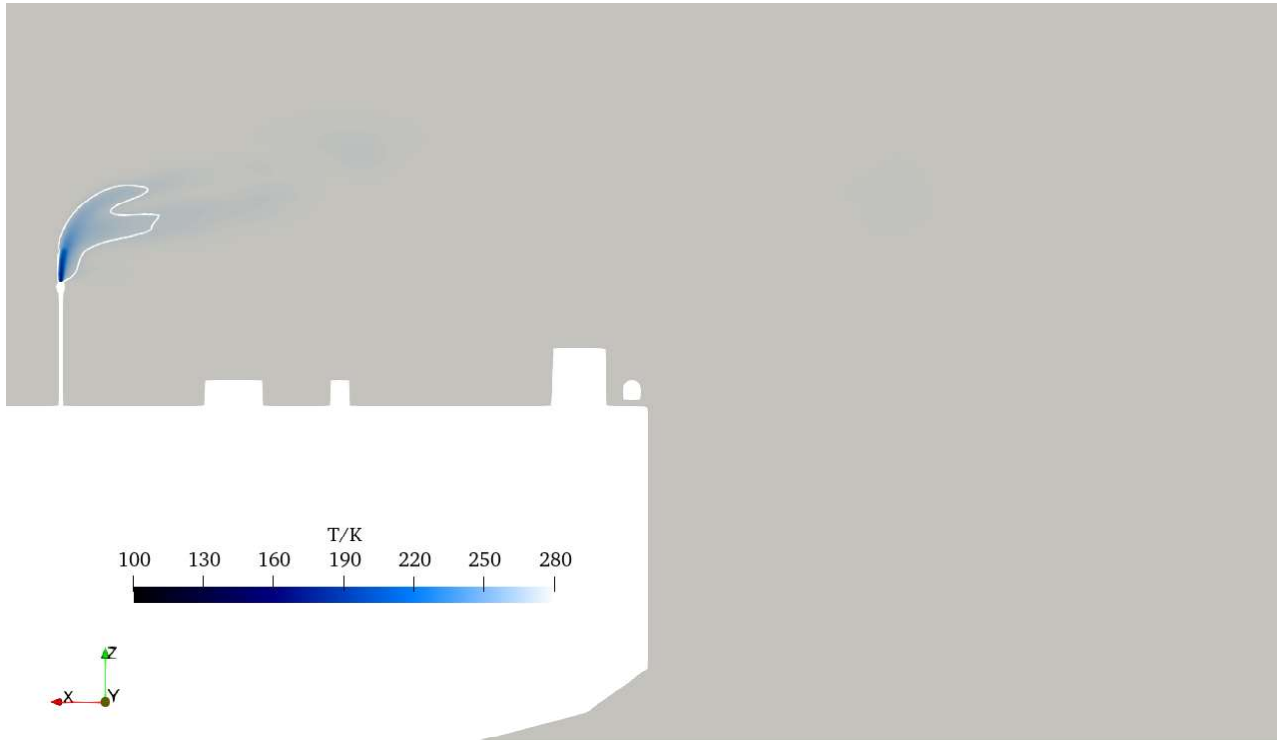
Fig. 7 Instantaneous temperature field (line: T = 273 K) at t = 200 s. ( T = 110 K at the vent)